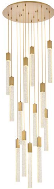
Stain Gold Item No: 2066G30SG