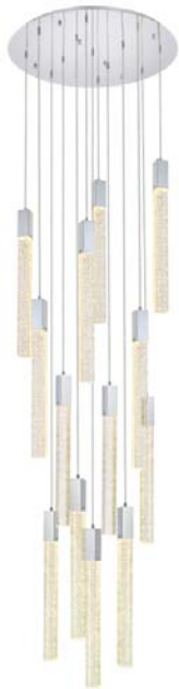
Chrome Item No: 2066G30C